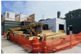
Sep 29th, 2023 by Jeramey Jannene

Airport Train Station Construction Progressing