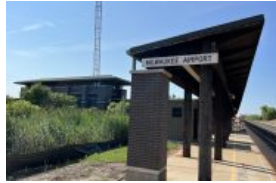
Sep 22nd, 2023 by Jeramey Jannene

Airport Train Station Construction Progressing