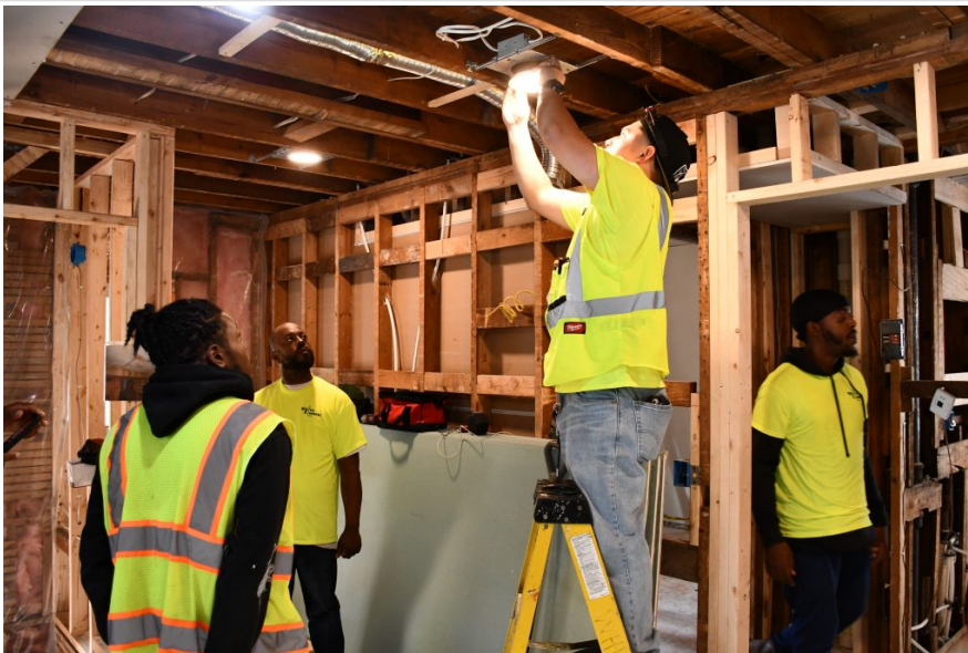
Ezekiel Community Development Corp. workers install a light fixture.

One of the 150 vacant, city-owned homes that are to be renovated under a federally-backed City of Milwaukee program was on display Friday.